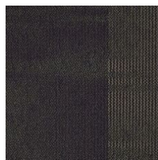
Black To Busine 58505